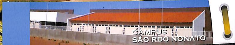
CAMPUS SÃO RDO NONATO